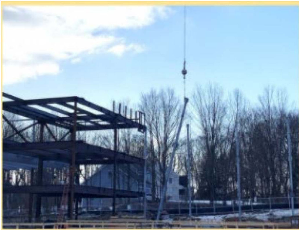
Building B steel erection