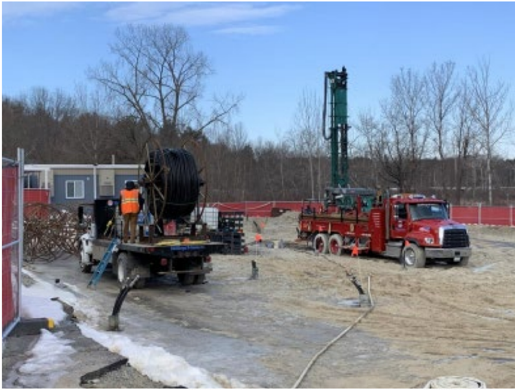
Geothermal Well Drilling in progress