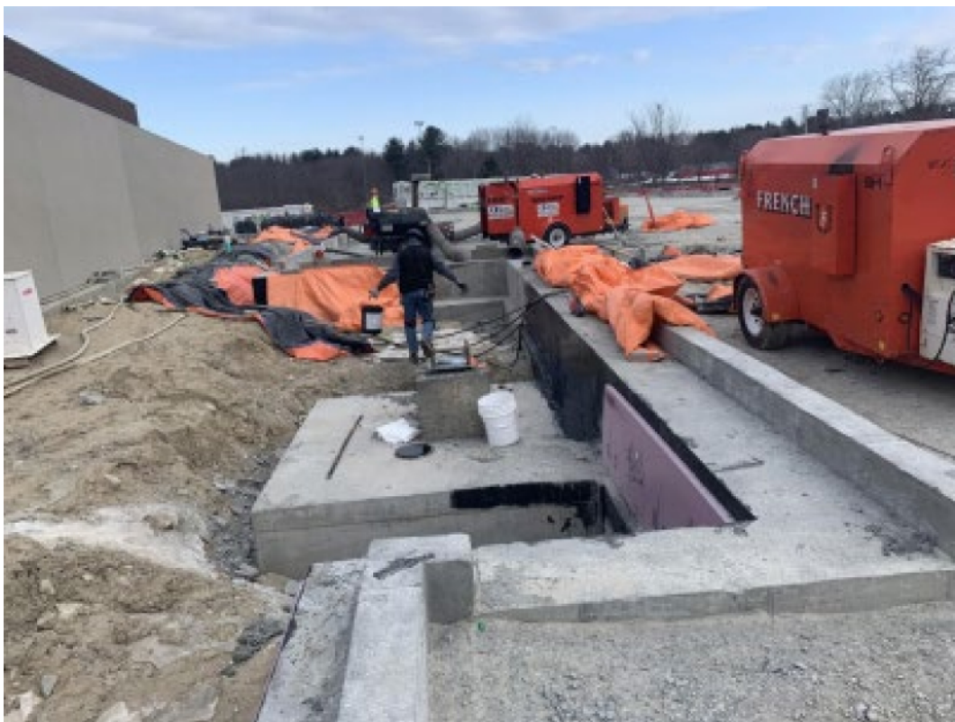
Dampproofing Foundation area C