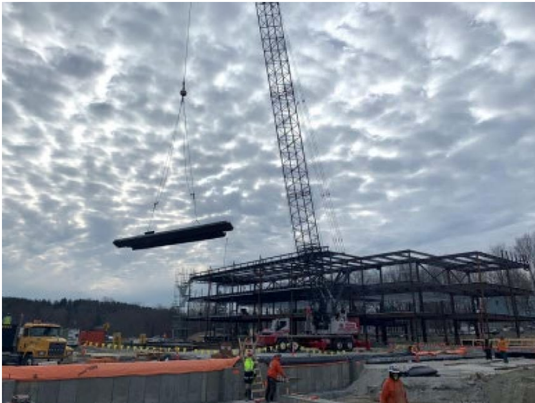
Building A Steel Erection