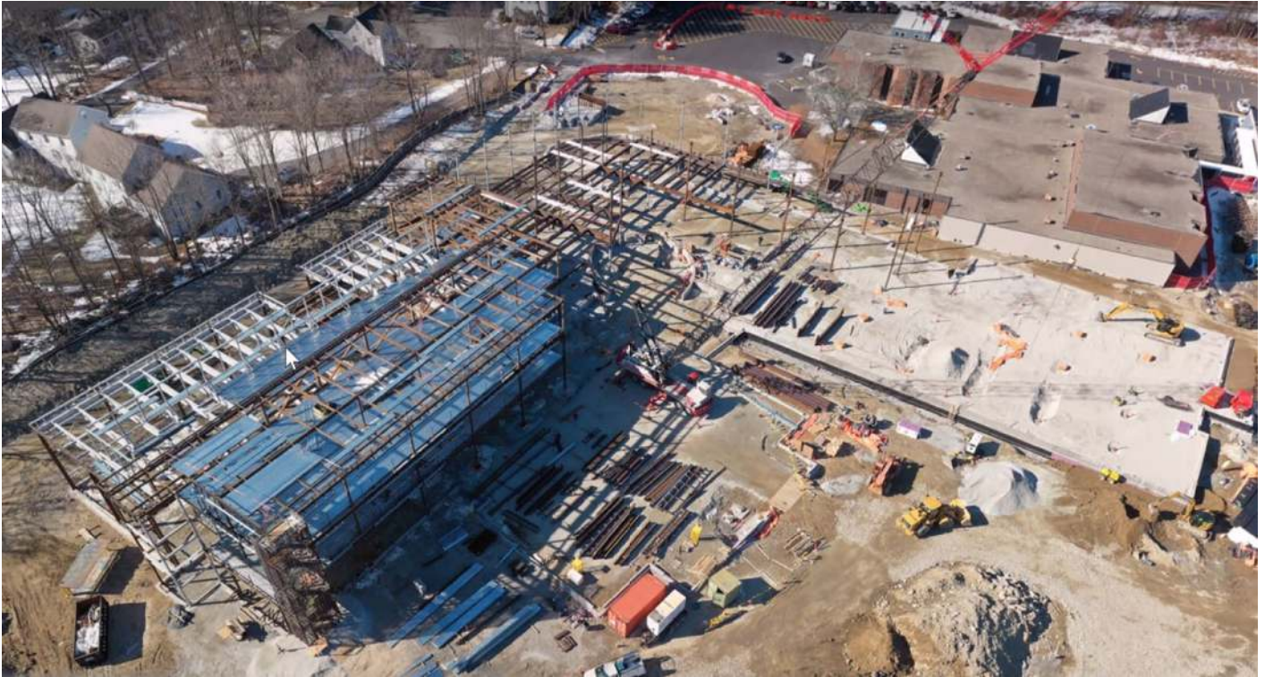
Site Overview as of March 9, 2021