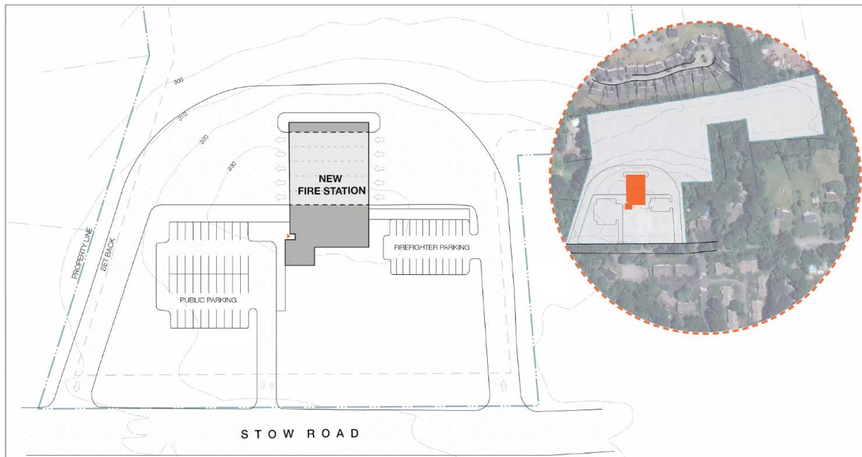
Drawing #1: less space and more facing Stow Road