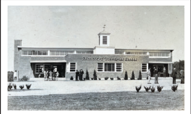
Blanchard Memorial School, 1949