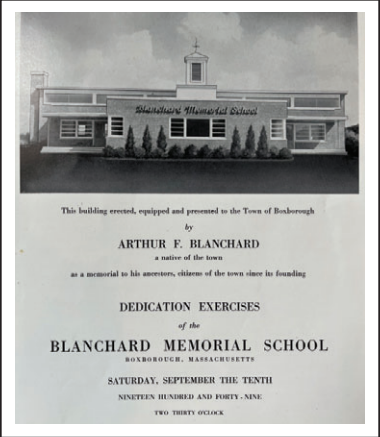
Program for Blanchard dedication, 1949